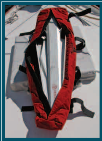
The FX-125 is very large but lightweight because it is made of high-tensile aluminum magnesium alloy.

The Navy testers noted that “high-strength steel” might be less “susceptible to permanent deformation under concentrated or unanticipated loading conditions,” but that Fortress compensated for the aluminum alloy it uses “through careful structural design.”